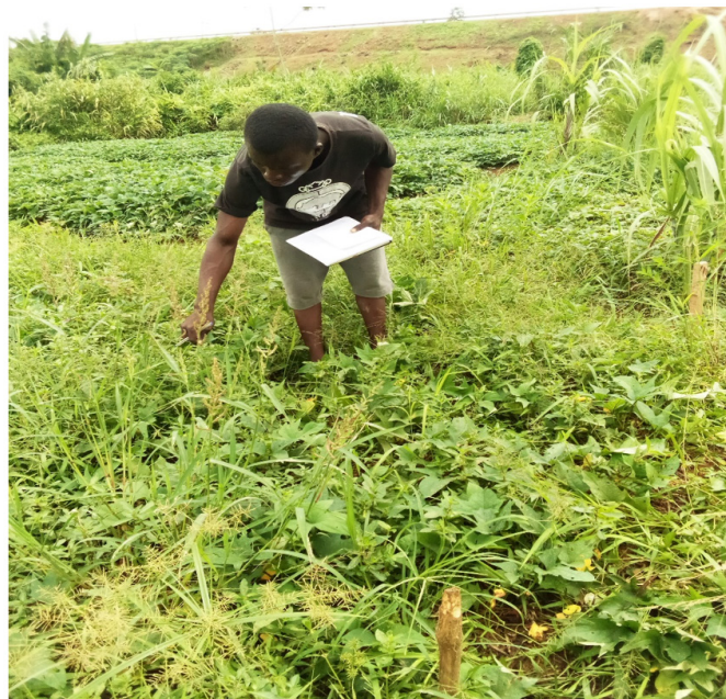
Figure 1: Inventory of weeds in a sweet potato plot

1993). It thus makes it possible to identify species that may have been missed during the surveys in the delimited areas. Each of the four locations was surveyed 30 times, resulting in a total of 120 surveys.